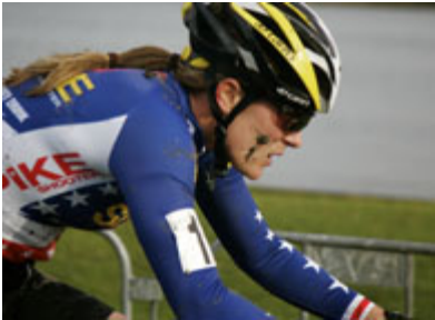
Katie Compton Cycling