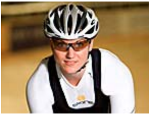
Anna Meares Cycling